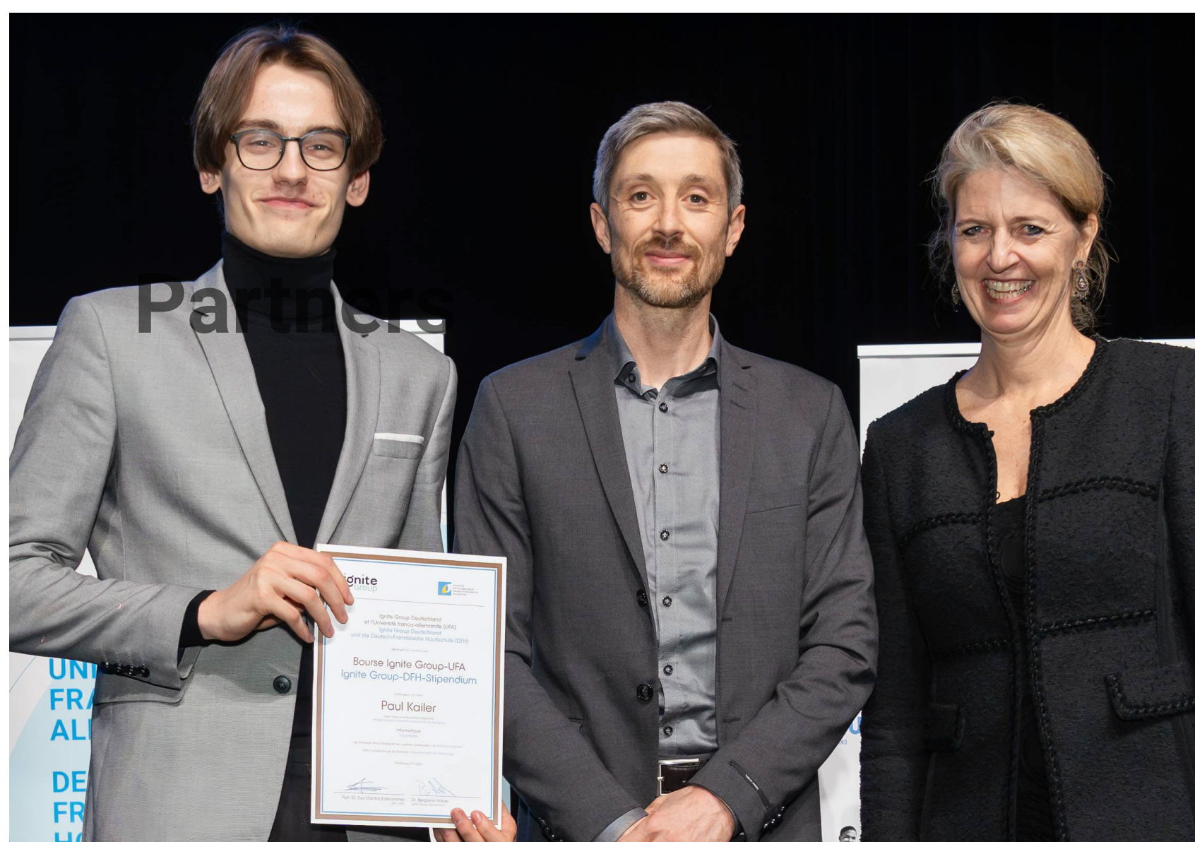
Awarding of the BNP Paribas and Ignite Group scholarships at the opening ceremony of the Franco-German Forum on 15 November 2024